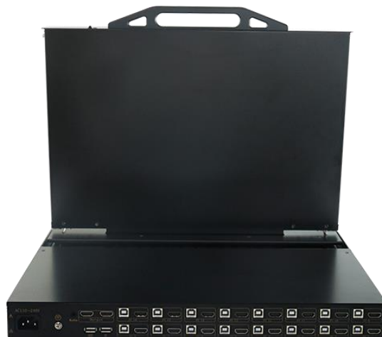
▲ Back view